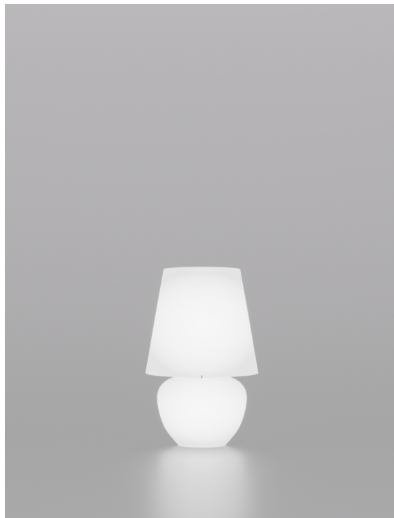
NAXOS LT 33 BCST BC 14E CE